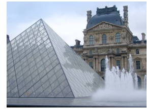
Pyramids at the Louvre, Paris