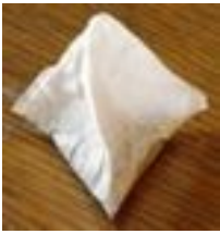
PG Tips Tea Bag Pyramid