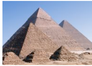
Pyramids in Gaza, Egypt