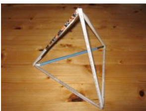
Skeleton of a Tetrahedron

What is the same about the square based pyramid and the triangular based pyramid?