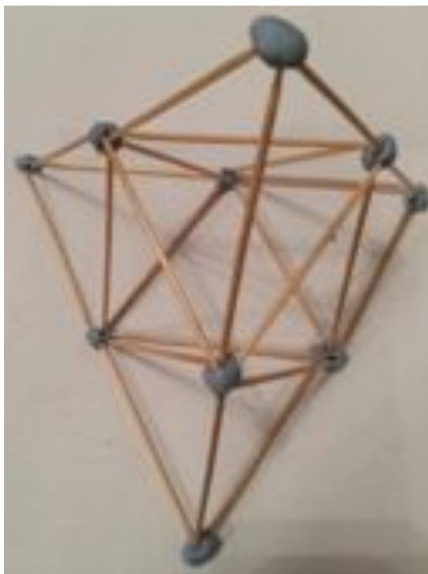
Sierpinski tetrahedron made out of four tetrahedra

Make four tetrahedra. Stick 3 together to make a larger triangular base and stick the fourth tetrahedron on top.