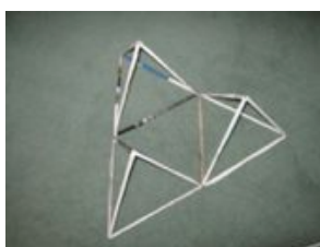
Three tetrahedra make the base

Make four tetrahedra. Stick 3 together to make a larger triangular base and stick the fourth tetrahedron on top.